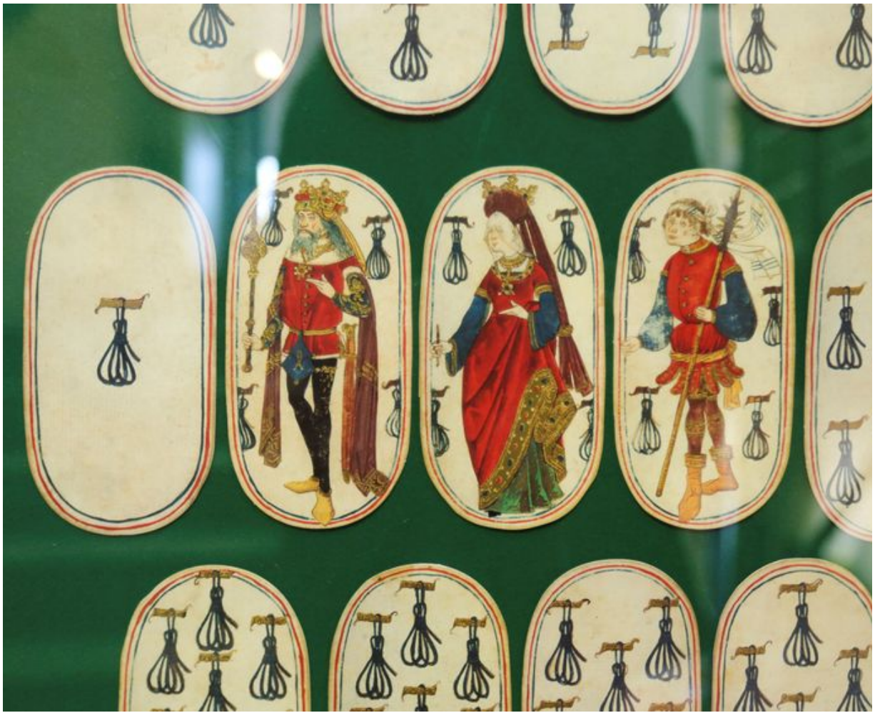
Old fashioned cards decks are exposed at the Bridge Museum, in Leerdam