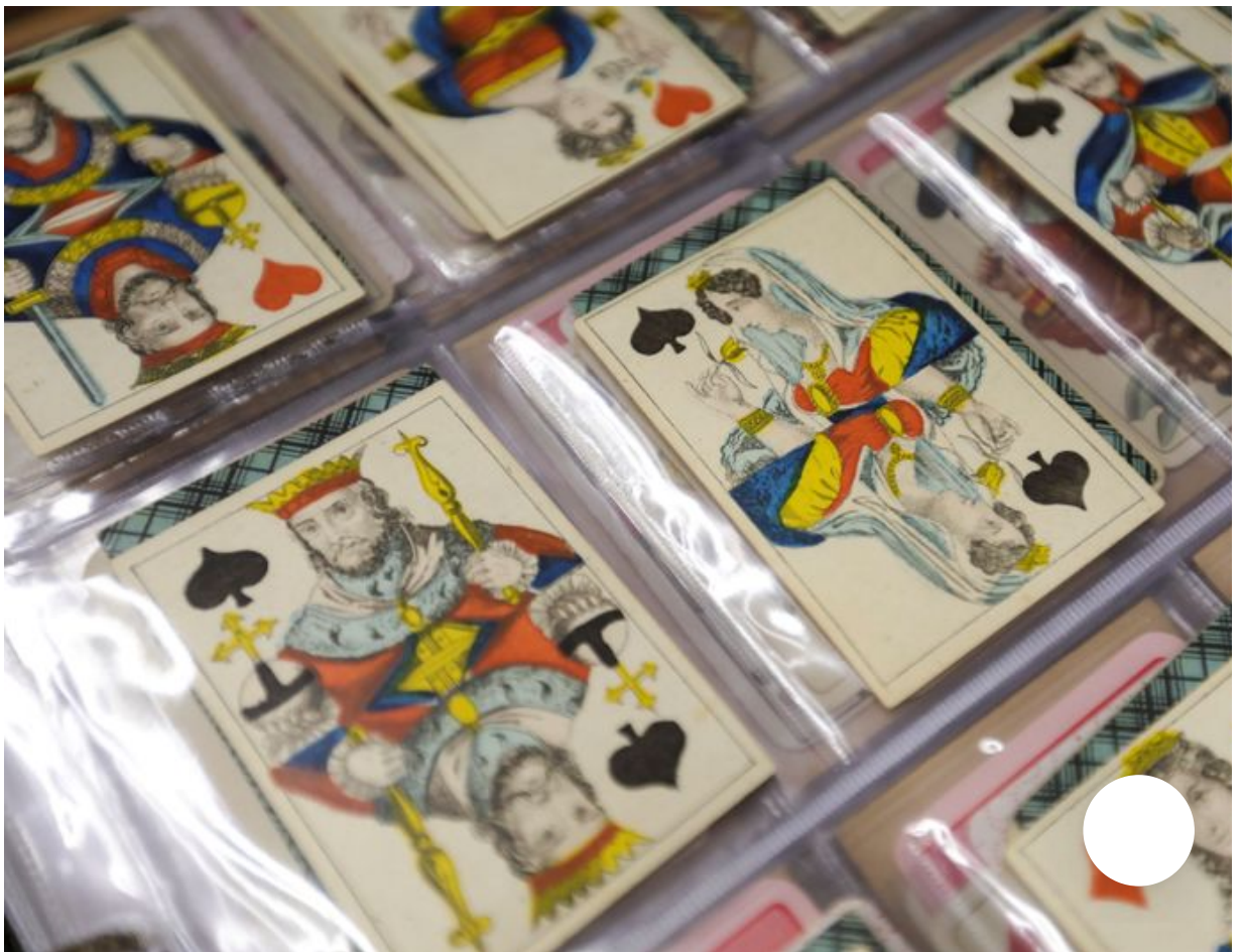
Old fashioned cards decks are seen in an album at the Bridge Museum, in Leerdam