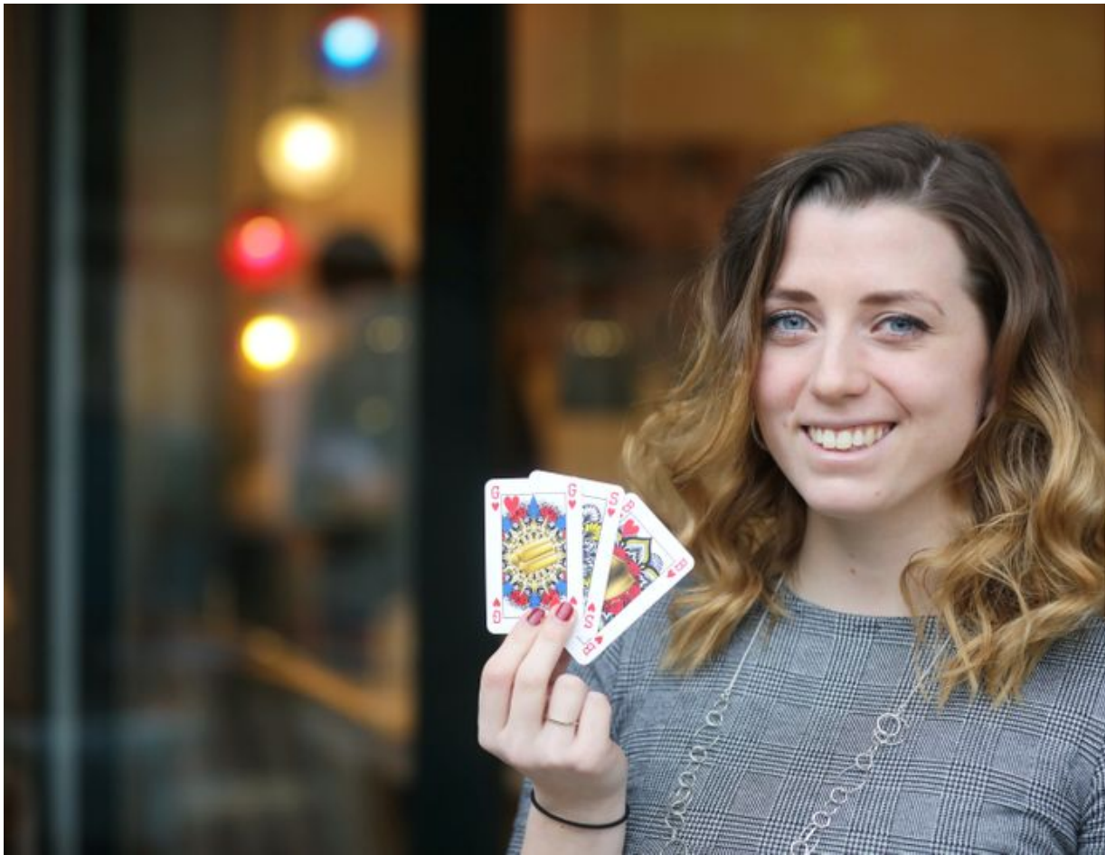
Indy Mellink designed genderless playing cards to stop inequality in Oegstgeest, Leiden